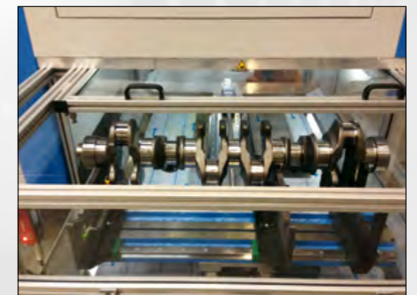
Slides for loading and unloading of the machine