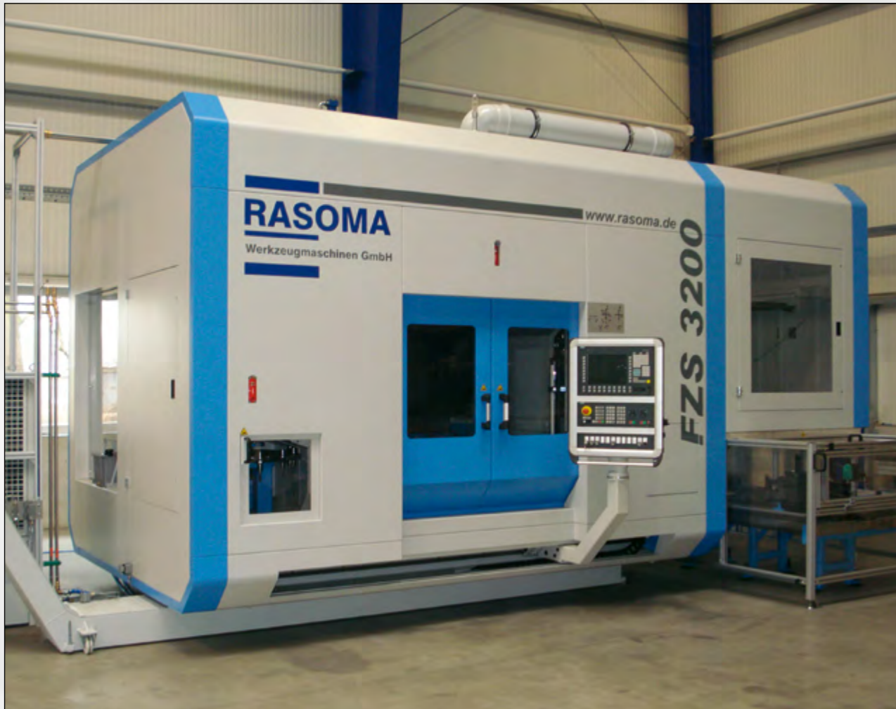
Our newly developed modular constructed CNC manufacturing center FZS 3200 is especially qualified for processing oil drilling and weight reducing holes of crankshafts or similar undulated parts of up to 1,150 mm in length