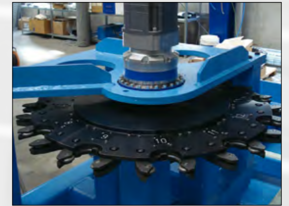
Tool magazine for 12 tools