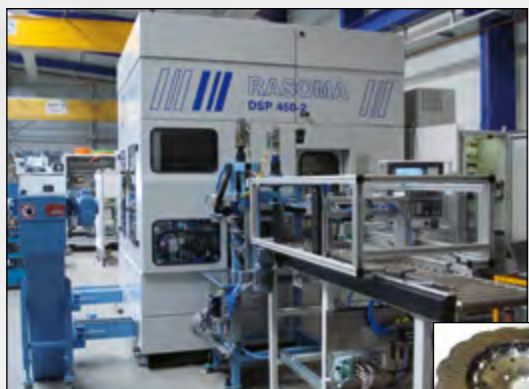
RASOMA double spindle-machining center DSP 450-2 e. g. for perforating braking discs