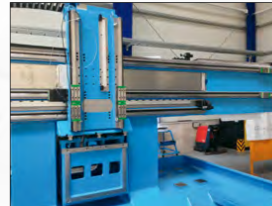
The base frame of the machine with longitudinal slide on three linear guides, cross slide for suspended, pivoting tool spindle. Below the Y-slide with bolting surface for the clamping device