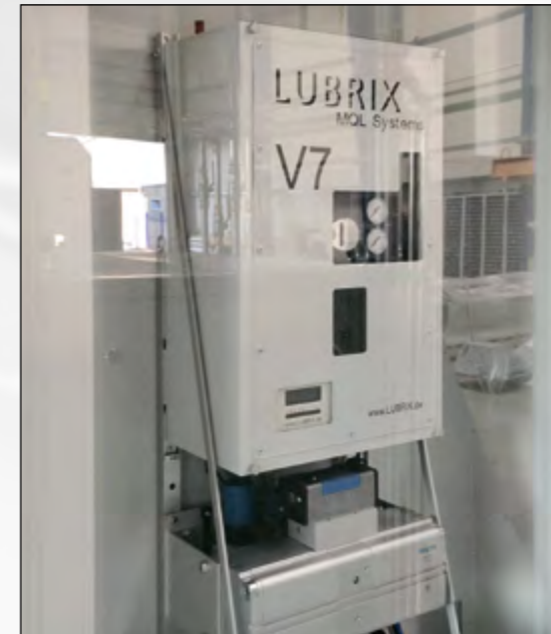
Minimal quantity lubrication causes optimal cutting values during deep hole drilling and is decisive for a high productivity. In addition, it fulfills cost saving in comparison to the classical application of high pressure cooling lubricant systems