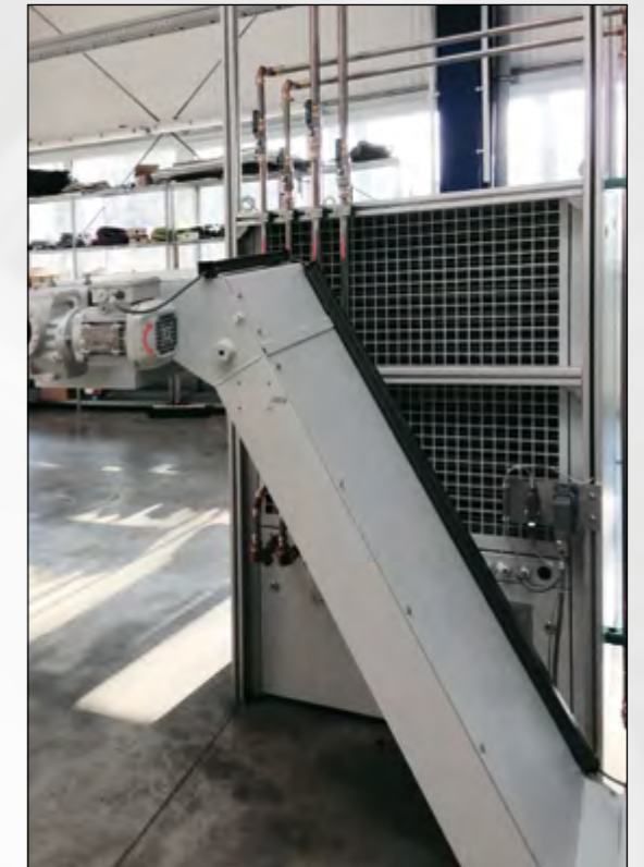
Cooling device and chip conveyor