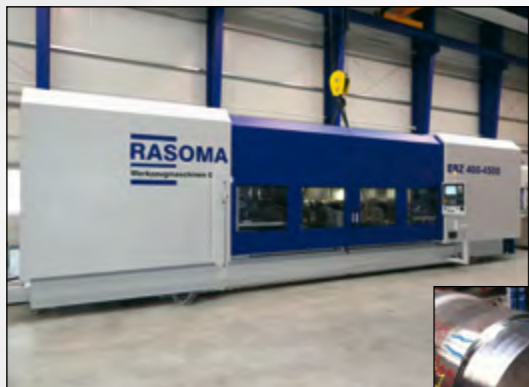
EBZ 400-4500 for end- machining large crankshaft of up to 4,500 mm in length